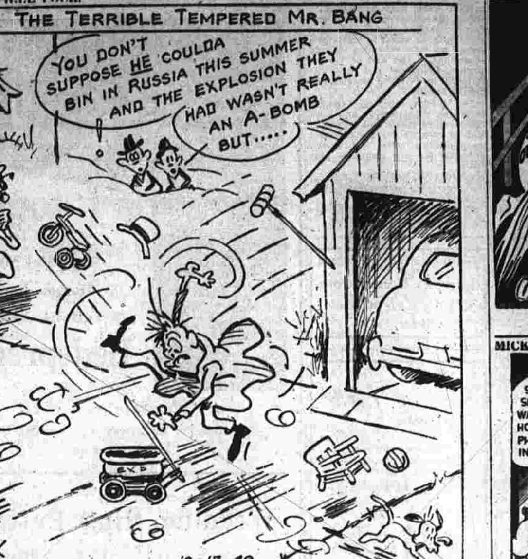
(Reprinted by The Bell Syndicate, Inc.) 10-17-49